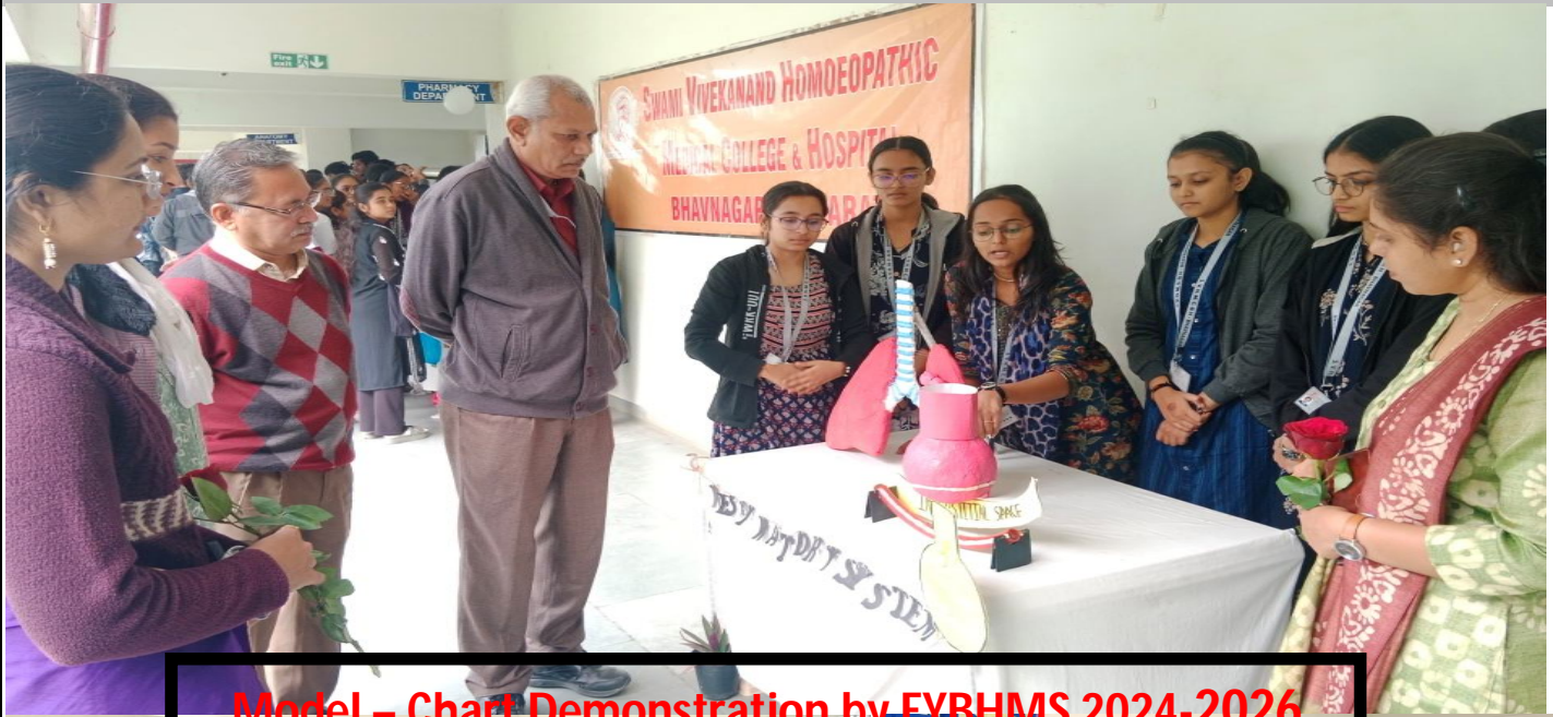
Model – Chart Demonstration by FYBHMS 2024-2026