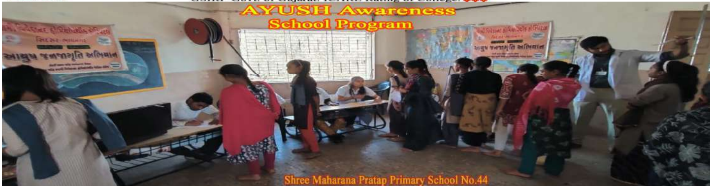
Shree Maharana Pratap Primary School No.44