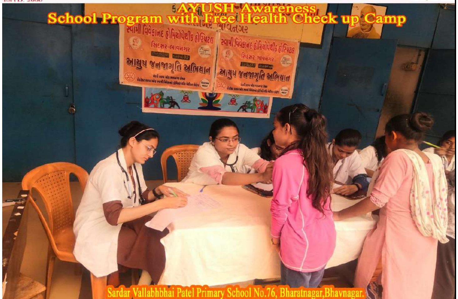
Sardar Vallabhbhai Patel Primary School No. 76, Bharatnagar, Bhavnagar.