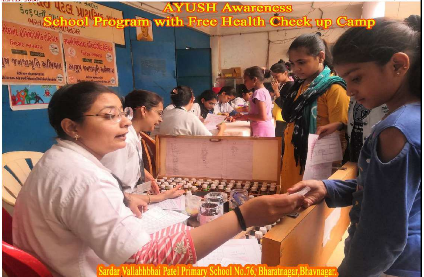
Sardar Vallabhbhai Patel Primary School No.76, Bharatnagar, Bhavnagar.