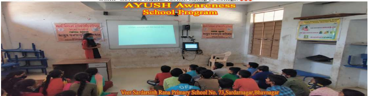
Veer Sardarsinh Rana Primary School No. 73, Sardarnagar, Bhavnagar