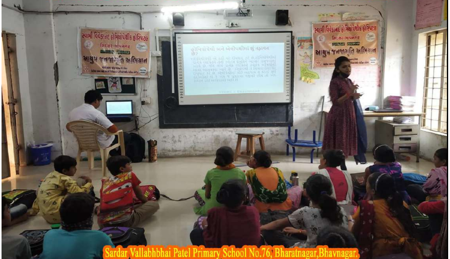
Sardar Vallabhbhai Patel Primary School No.76, Bharatnagar, Bhavnagar.