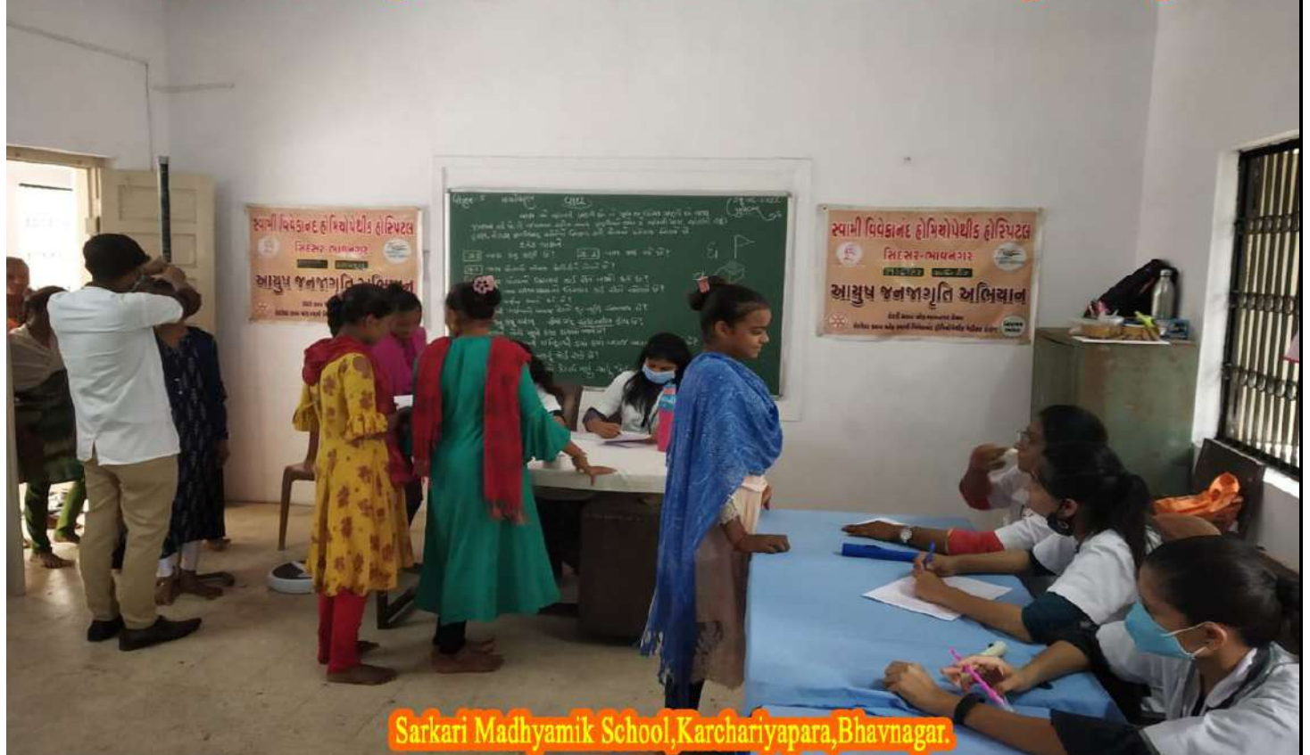
Sarkari Madhyamik School, Karchariyapara, Bhavnagar.